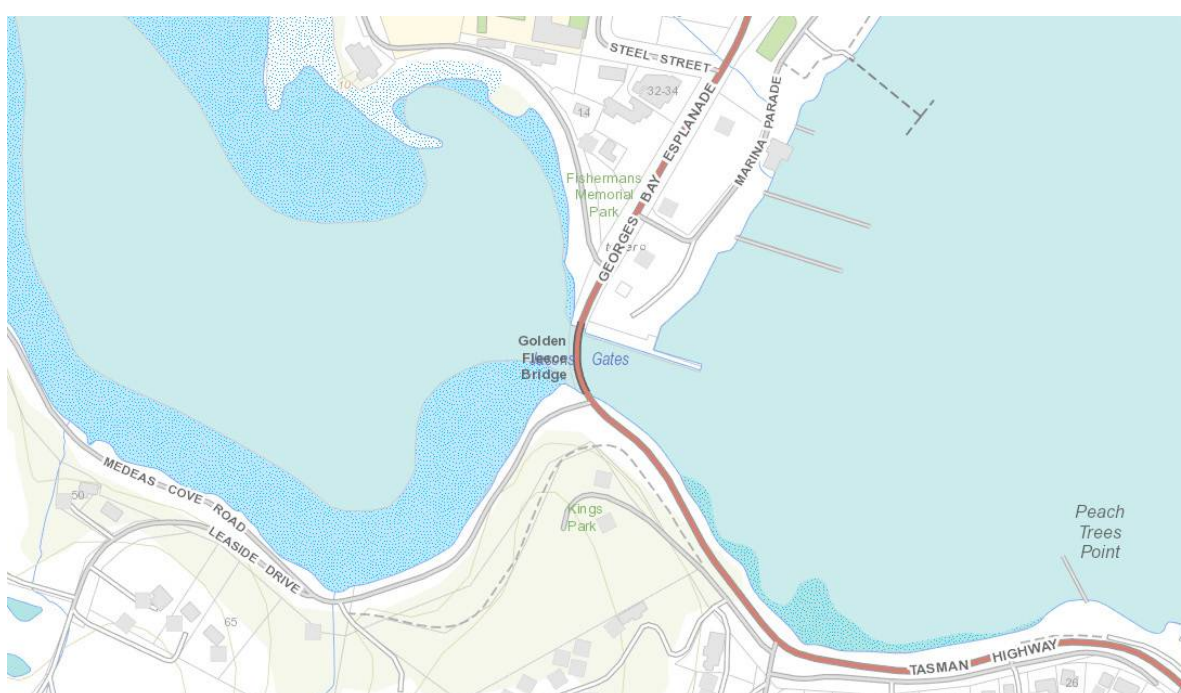
Figure BRE-P3.1 - Location of the Golden Fleece Bridge as required by clause BRE-S1.2.1